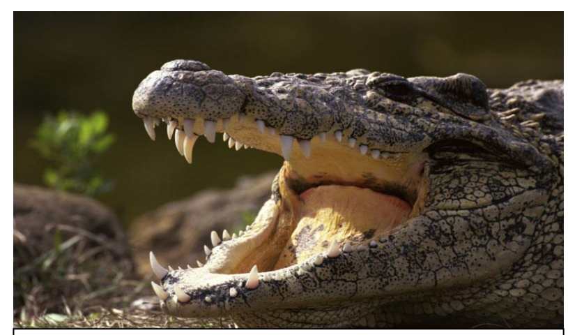
Crocodile grazing in the sun.

Crocodiles and alligators belong to a group of reptiles called crocodilians. These fierce carnivores (meat-eating animals) have not changed much for millions of years. Today, there are 14 different types of crocodile, 2 types of alligator and 6 types of caiman.