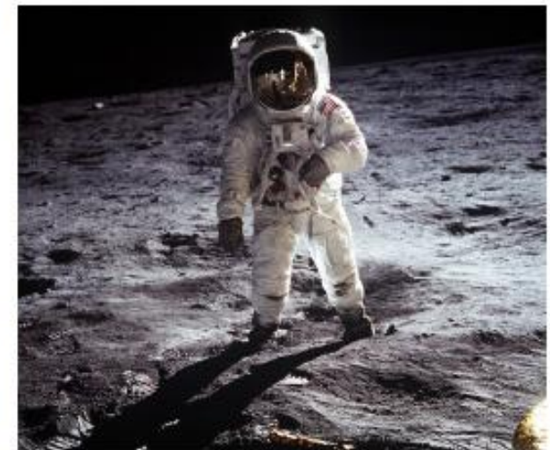
A photograph from the Apollo 11 moon landing.

But conspiracy theorists maintain that the moon landings never actually happened. At the time, America was involved in the “space race”: an unofficial contest with the USSR (now Russia) to see who could put a man on the moon first. The theory goes that time was running out, and America realised they would never be able to achieve a moon landing, so instead they hired a studio in Hollywood and faked the whole thing. Theorists believe that the photographs from the mission give the game away – the shadows are wrong, the American flag is waving when there is no wind, and no stars can be seen in the sky. Of course, scientists have countered all these points, and no-one has so far been able to explain how the American government would have been able to keep such a massive conspiracy under wraps!