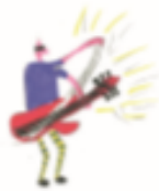
Guy with a Guitar

guess guest guard disguise guide guilty guy guitar vague tongue