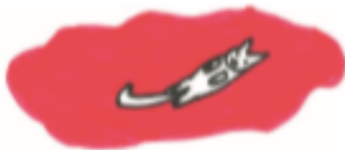
Kitten In the Ketchup

keenly kissed kettle kilo skinny sketched kidnapped kidding kitted skeleton