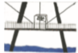
Fridge on the Bridge

fridge bridge judge fudge sludge splodge sledge budge trudged edge