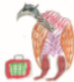
Vulture on an Adventure

vulture departure adventure temperature moisture lecture capture future picture creature