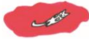
Kitten in the Ketchup

king kitten kipper keep kind kit skipped kite kitchen skidding