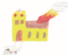
Murder In the Church

hurt murder blurted return natural murmur occur further survive disturb