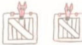
Foxes and Boxes

dominoes calves knives patches replies mysteries shelves halves dishes copies