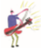
Guy with a Guitar

guiltily guarantee catalogue disguised guitarist guidance guessed penguin league dialogue