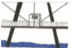
Fridge on the Bridge

knowledge dodging fidgeting judgement wedged dredge ledge badger ridge budgie