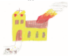
Murder In the Church

Thursday nurse curly purple purse turned surprised church burning burglar