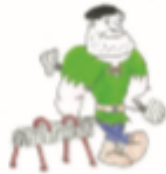
Gentle Giant In the Gym