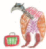
Vulture on an Adventure

mixture nature furniture signature mature puncture texture miniature gesture structure