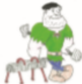
Gentle Giant In the Gym

general danger change imagine suggest average exaggerates vegetable emergency generously