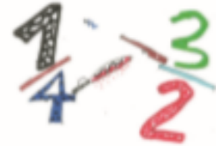
Fractions In Action

fractions action solution conversation question destruction creation satisfaction celebration station